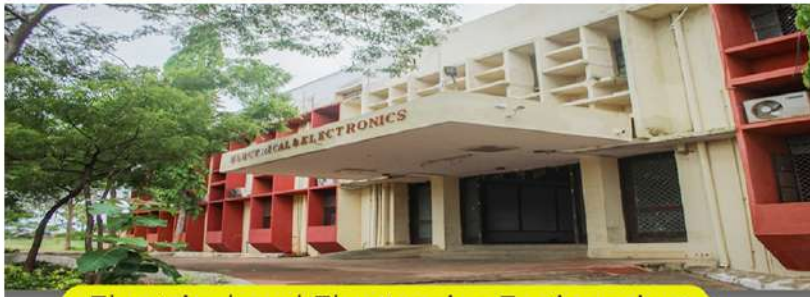
Electrical and Electronics Engineering