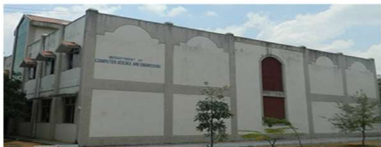
Computer Science and Engineering