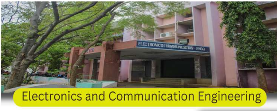
Electronics and Communication Engineering